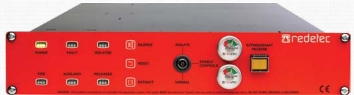
Redetec 3.0 with Point Detection

The Redetec IP module is fully configured in minutes using a web browser. No additional software is required.